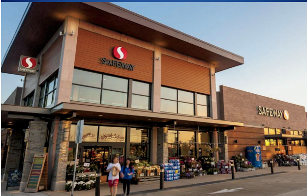
Grand Ridge Plaza | Issaquah, WA