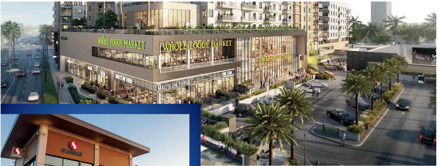
Bloom on Third | Los Angeles, CA