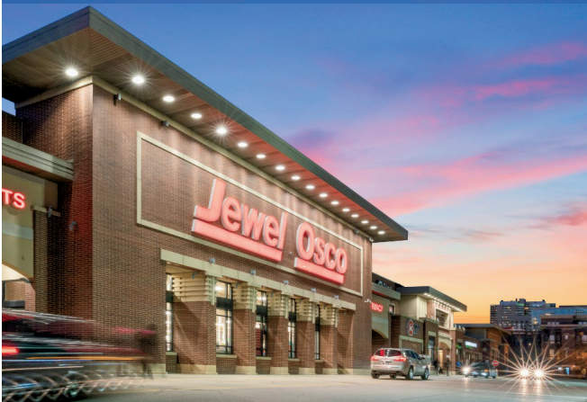
Old Town Square | Chicago, IL