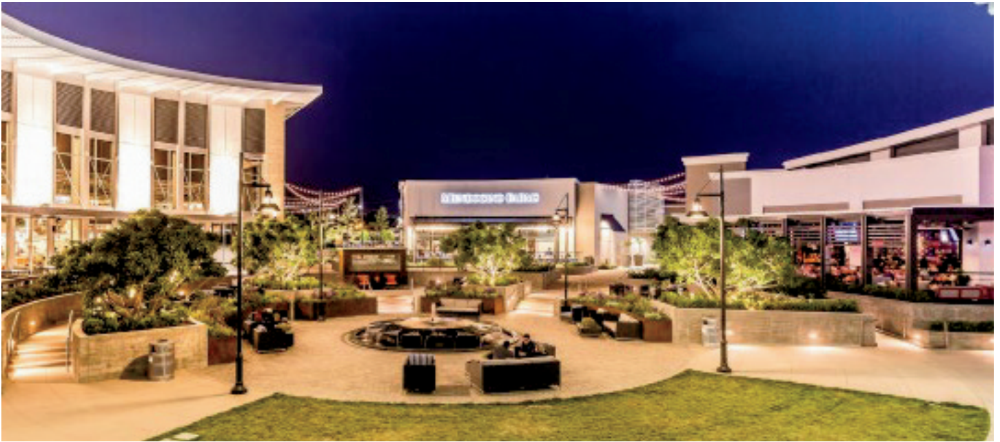
Village at La Floresta | Los Angeles, CA

Lastly, but importantly, Regency's success and accomplishments in 2023, and over the last 60 years, would not have been possible without the unwavering support of all our stakeholders. We are grateful for the continued commitment and engagement that our investors, tenants, joint venture partners, service providers, communities, Board of Directors and talented team have provided us over the last 60 years. We thank you for your loyalty and look forward to sharing many more years of success together.